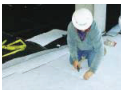
Preparing to complete installation of Enkamat 7918R over Enkasonic.